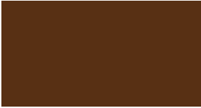
Sicoversal® B Brown 29-173595, PS1606